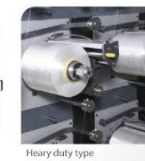
Heavy duty type