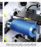
Electronically controlled yarn tensioner